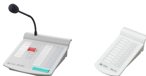
RM-200M Remote Microphone