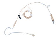
Ear-Hook Microphone Trantec YP-MS4E