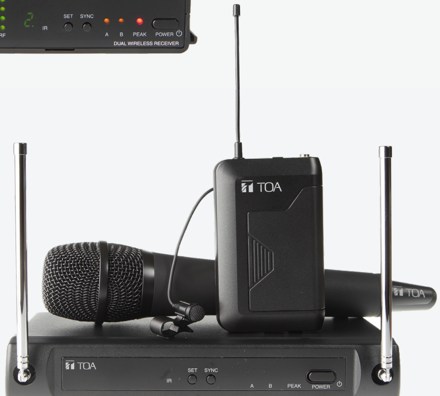
Single Channel Wireless Microphone System Z-WS420-AS Z-WS430-AS