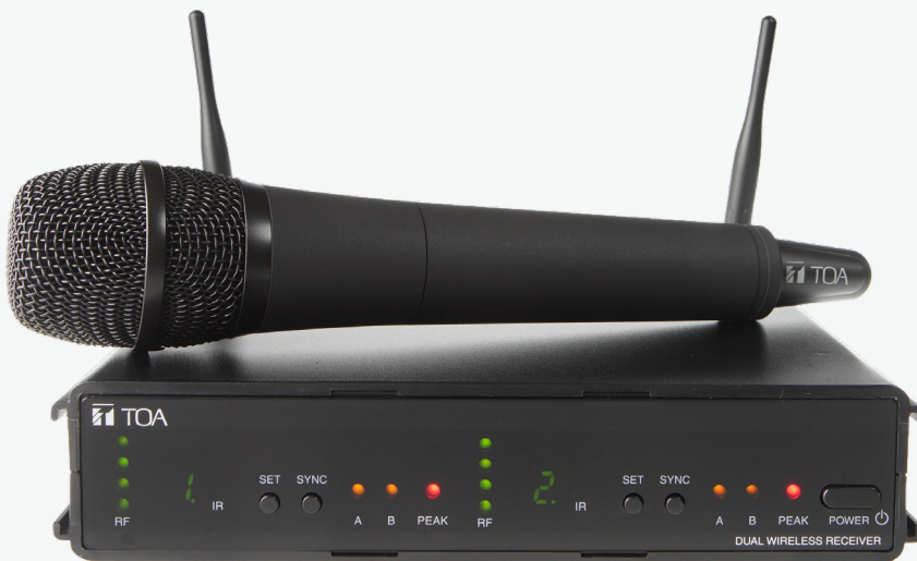
Dual Channel Wireless Microphone System Z-WS422-AS