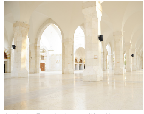
Application Example : House of Worships