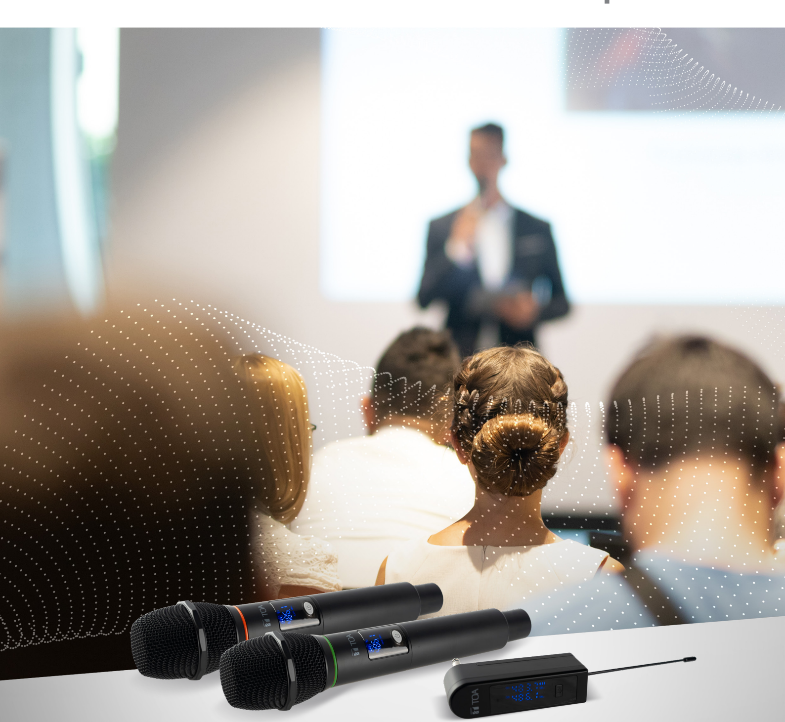
Clear Sound, Easy Setup, Rechargeable Battery Perfect for Every Space