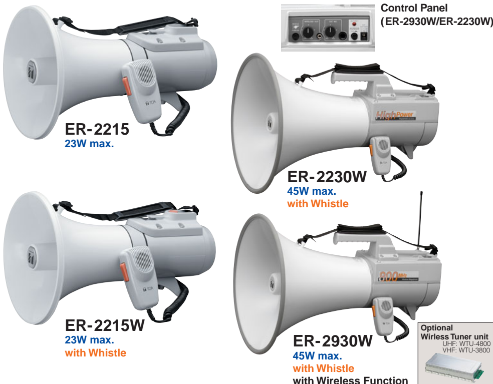
ER-2215 23W max.