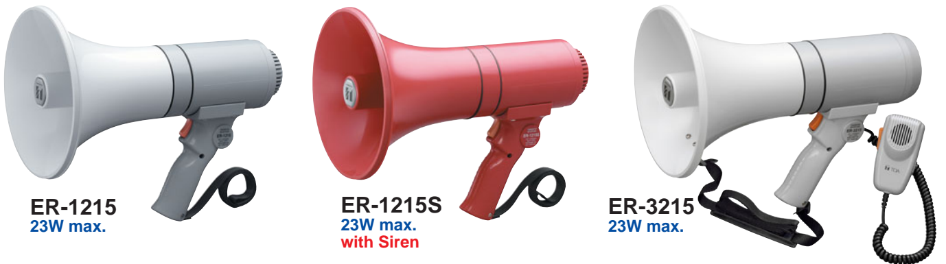
ER-1215 23W max.