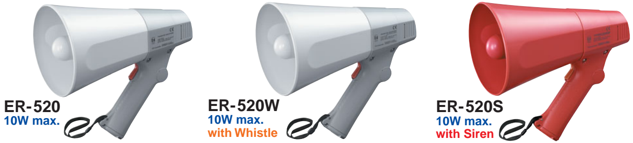
ER-520 10W max.