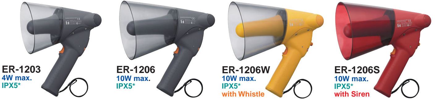
ER-1203 4W max. IPX5*